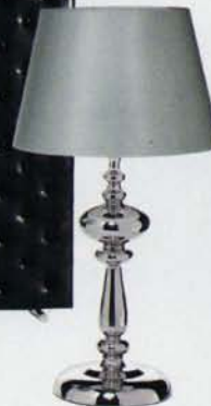
🏠 Silver lamp base R399 Satin Duck Egg shade R299 Loads of Living