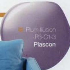
🏠 Plum Illusion P3-C1-3 Plascon