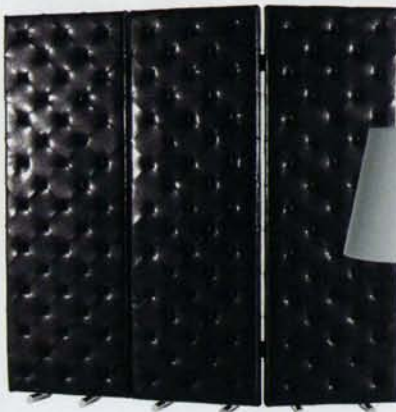
🏠 Padded screen R1 900 @home