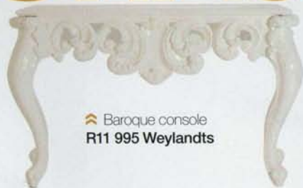
🏠 Baroque console R11 995 Weylandts