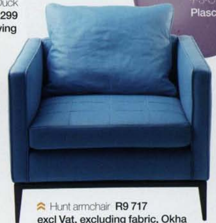
🏠 Hunt armchair R9 717 excl Vat, excluding fabric, Okha