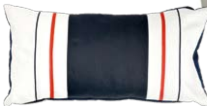
» Studio.w jersey-knit duvet set R250 Woolworths