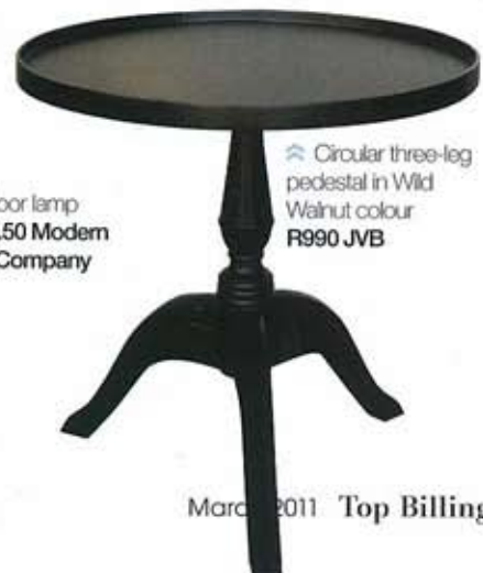
» Circular three-leg pedestal in Wild Walnut colour R990 JVB