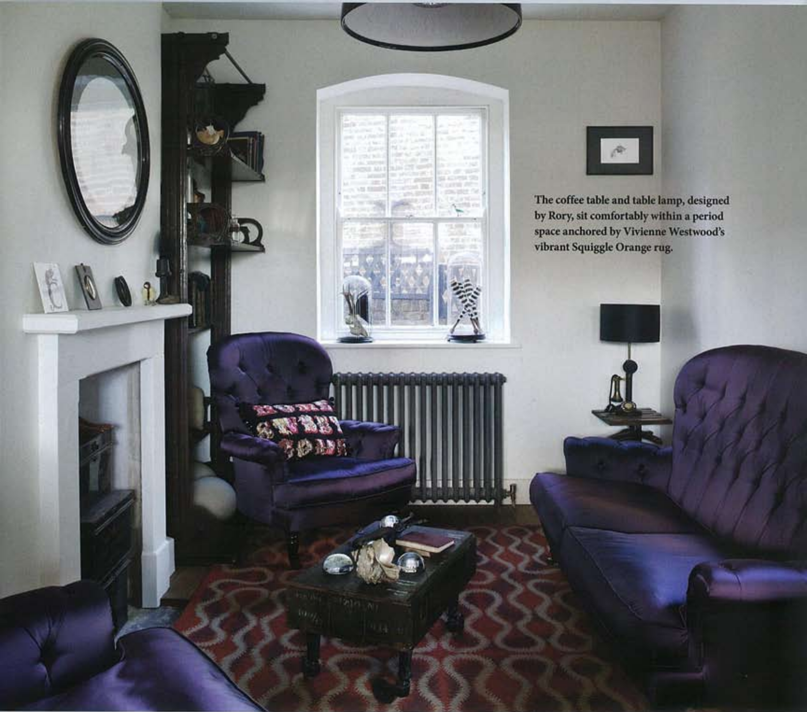
The coffee table and table lamp, designed by Rory, sit comfortably within a period space anchored by Vivienne Westwood's vibrant Squiggle Orange rug.