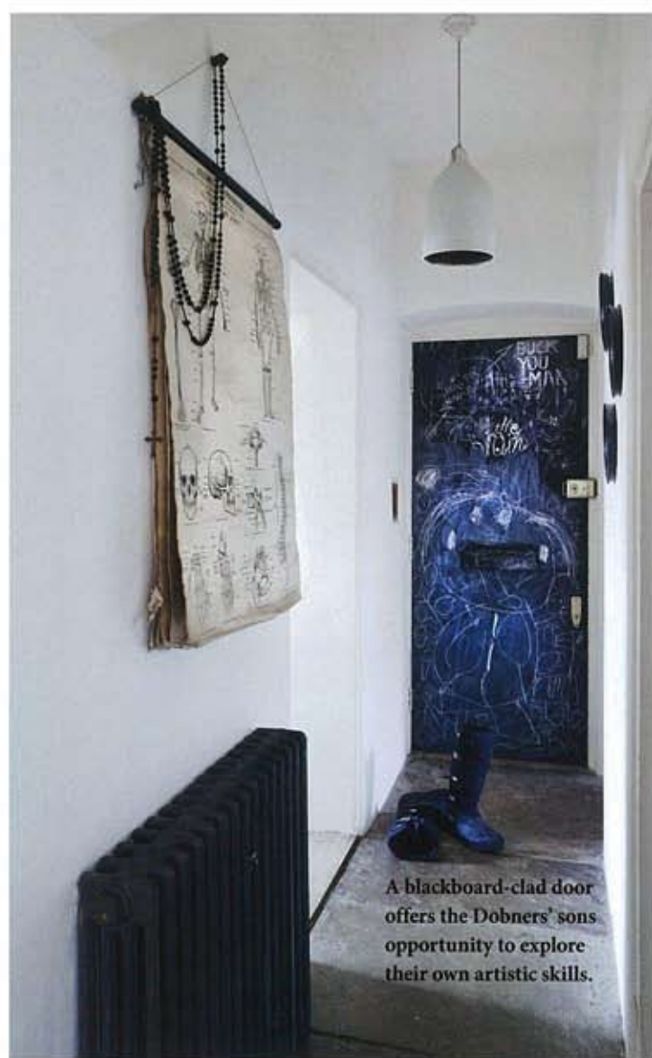
A blackboard-clad door offers the Dobners' sons opportunity to explore their own artistic skills.

affluent families of Flask Walk, a Camden Council document stipulates it as the second-oldest surviving example of council-housing in Britain. Nearly a century-and-a-half later it gained notoriety when Sid Vicious and Johnny Rotten made temporary residence in one of the flats, their drug-induced antics leaving behind an indelible presence that visiting tourists to this day bear witness to.