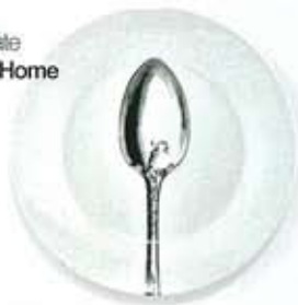
» Script Side Plate R15.99 Mr Price Home