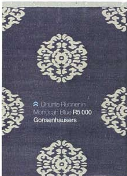
» Dhurie Runner in Moroccan Blue R5 000 Gonsenhausers