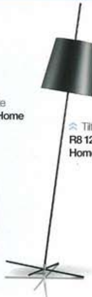
» Tilt floor lamp R8 122.50 Modern Home Company